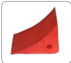
URETHANE WHEEL CHOCK