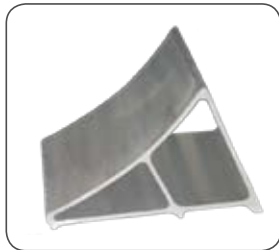
ALUMINUM WHEEL CHOCK