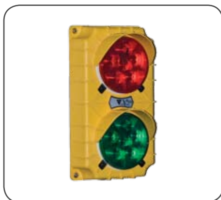
STOP & GO LIGHTS