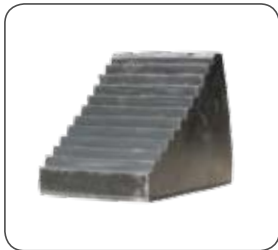
RUBBER WHEEL CHOCK