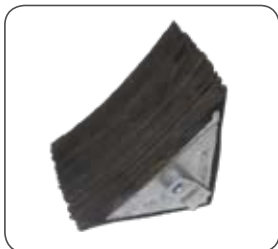
LAMINATED WHEEL CHOCK