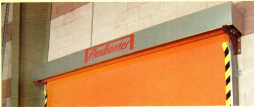
FlexEC (Exterior Cover) is an attractive and protective faceplate for exterior use. The ends are sealed to provide an extra level of protection for the door roll. FlexIC and EC are both made of heavy gauge steel.