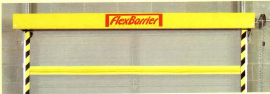
FlexIC (Interior Cover) is an attractive faceplate as well as a protective valance for the door roll.