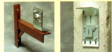
Inside Wall Bracket