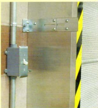
(Above) Metal sheeting covers the side of the guide tracks to provide a secure seal.

F lexGuard Chain Mesh Security Doors are available in various aluminum or stainless steel mesh sizes. And the security doors are easy to install in a variety of models and mounting options.