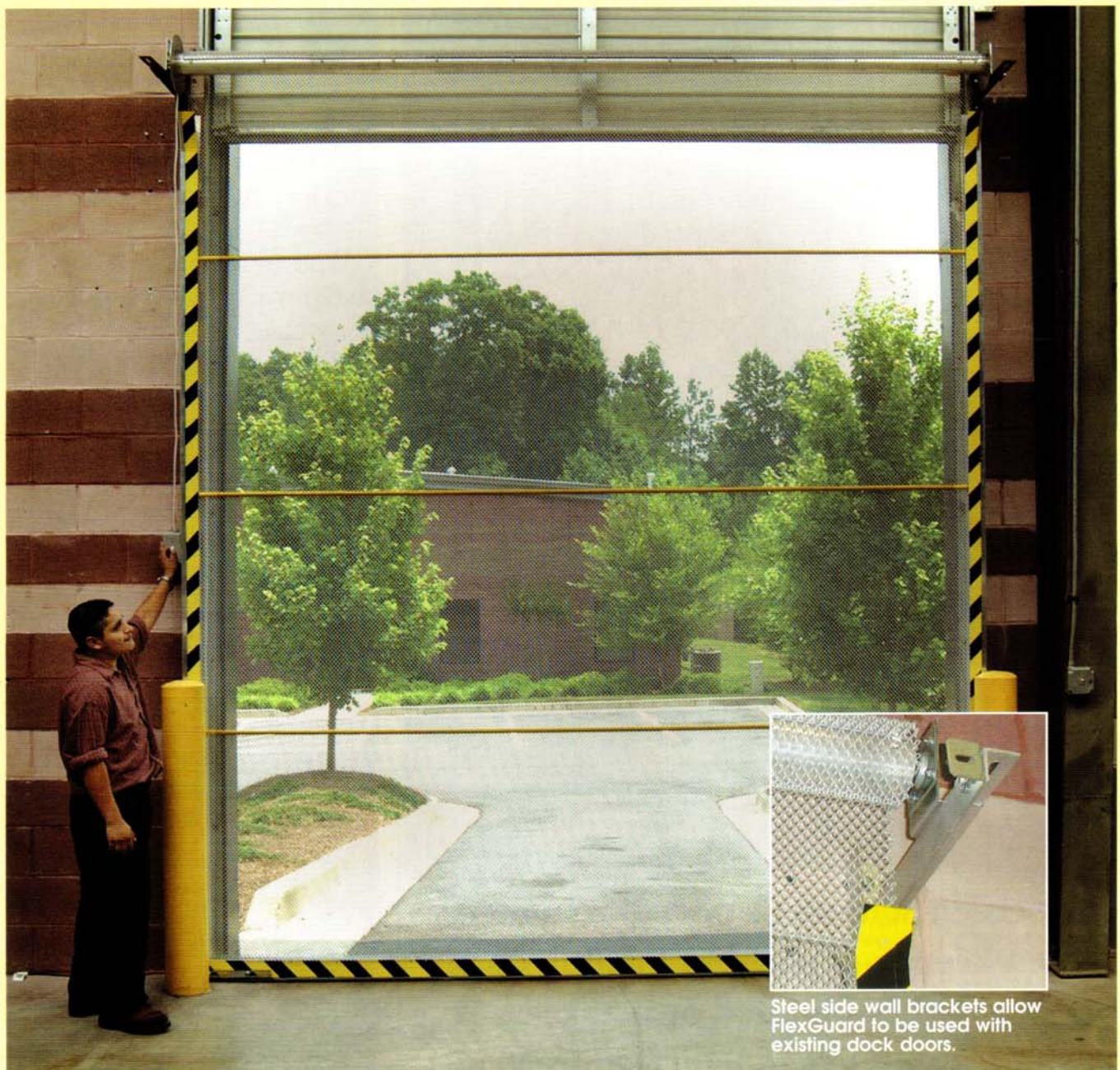
Steel side wall brackets allow FlexGuard to be used with existing dock doors.

FLEXGUARD CHAIN MESH SECURITY SCREEN DOORS THAT ROLL-UP AND