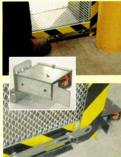
(Right) Kick-latch at the bottom of FlexGuard doors allow lockdown. An automatic kill switch eliminates motor damage.