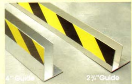
Safety Striped Guide Tracks in two sizes